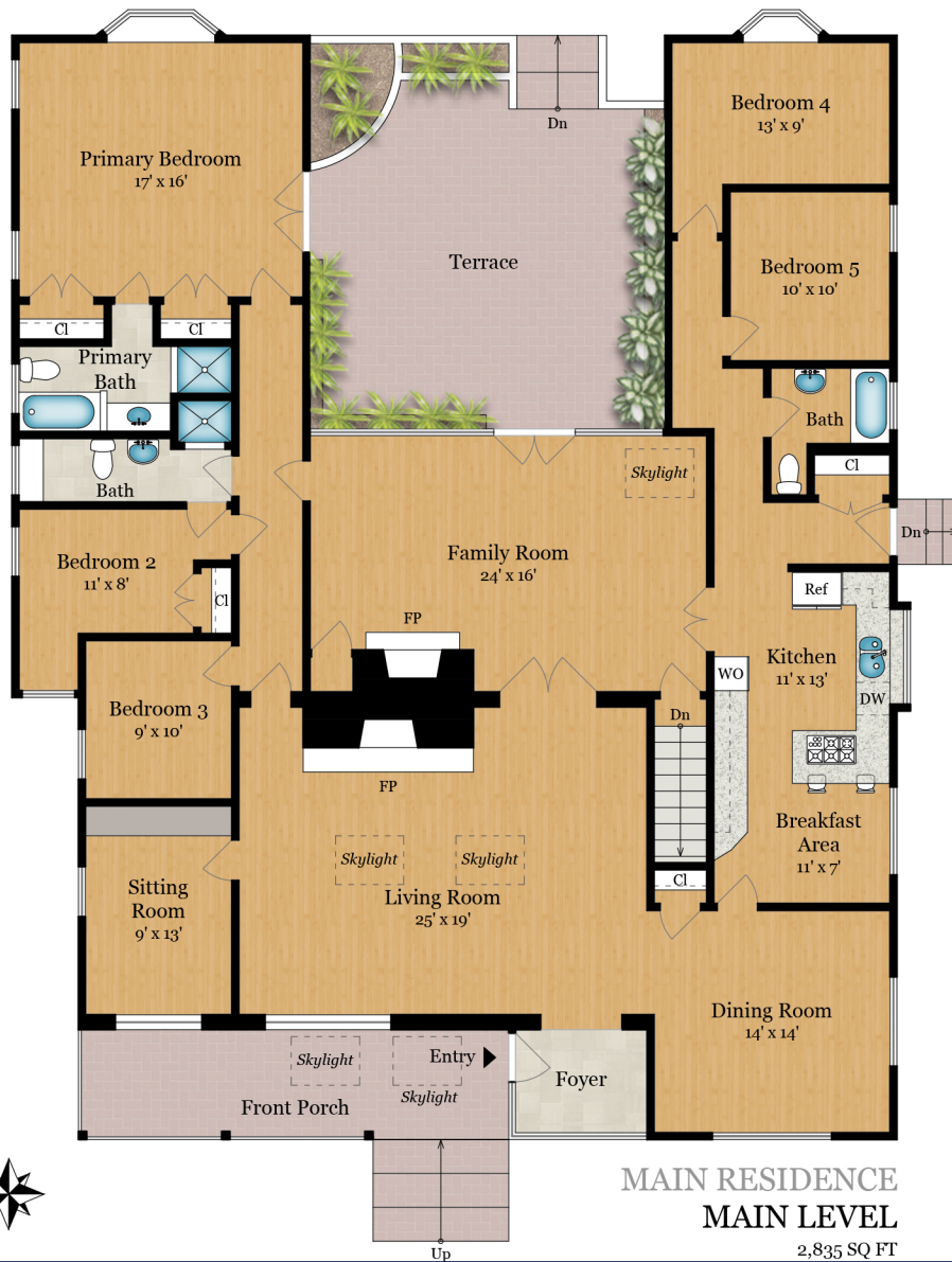
MAIN RESIDENCE MAIN LEVEL 2,835 SQ FT

Estimated Total Finished Square Footage: 3,400 SQ FT