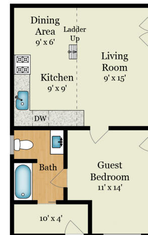
GUEST HOUSE 565 SQ FT